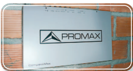
▲ WALL MOUNTING AVAILABLE ▲

CompactMax-1 is a compact transmodulation system that allows to distribute Satellite TV channels (DVB-S or DVB-S2) in Digital Terrestrial Television (DVB-T) format. It can be connected to up to 4 satellite inputs (2 inputs for free channels and 2 for encrypted ones) to deliver up to 8 DVB-T muxes with dynamic webserver management via remote control. It is integrated into a 19" 1U Rackmount case. It can also be mounted directly on the wall.